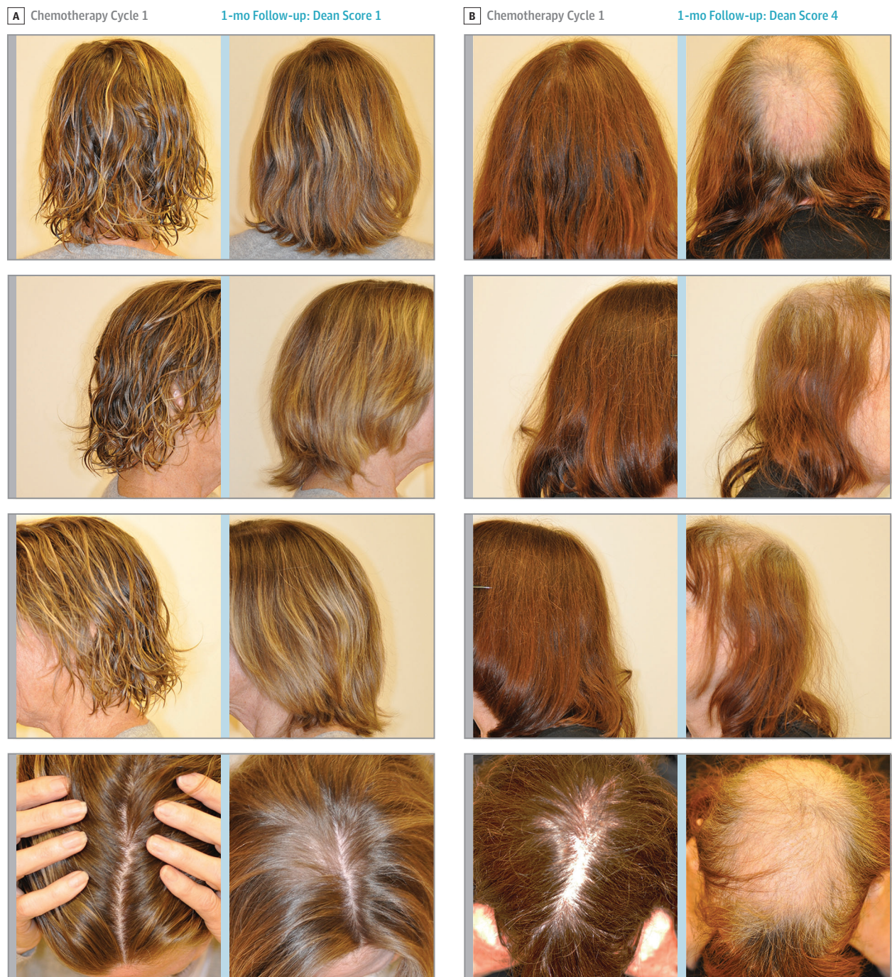
Figure 2. Photographic Results of 2 Patients Treated With Scalp Cooling

A, Patient photographs from 4 different angles before the start of chemotherapy cycle 1 (Dean score of 0; hair loss of 0%) and 1 month after completion of 4 cycles of chemotherapy with docetaxel ( 60 \text{ mg/m}^2 ) and cyclophosphamide ( 600 \text{ mg/m}^2 ) (Dean score of 1; hair loss >0\% – \leq 25\% ). 8